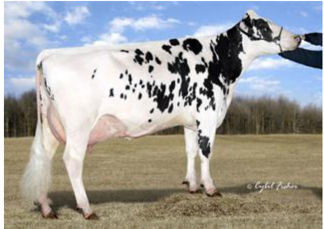
BG Olaf great granddam C-Haven Tashas Shottle Tish