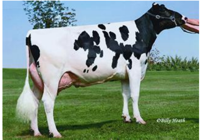
BG Martin granddam Glen-Toctin Shottle Liva