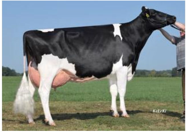
Percey-Red granddam America