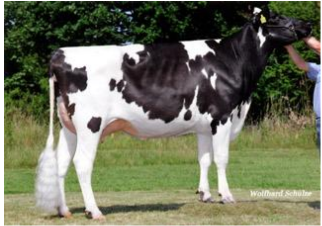
Soccer granddam Tessa