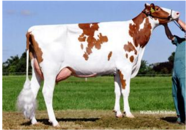
Mix-Red PP granddam Roxy