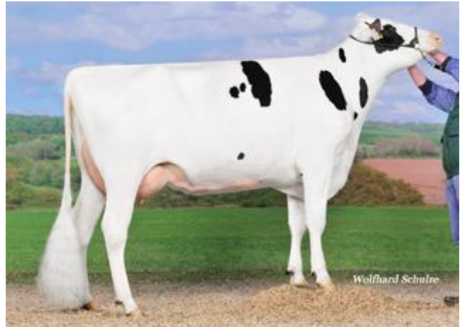
Mirror dam WKM Celina