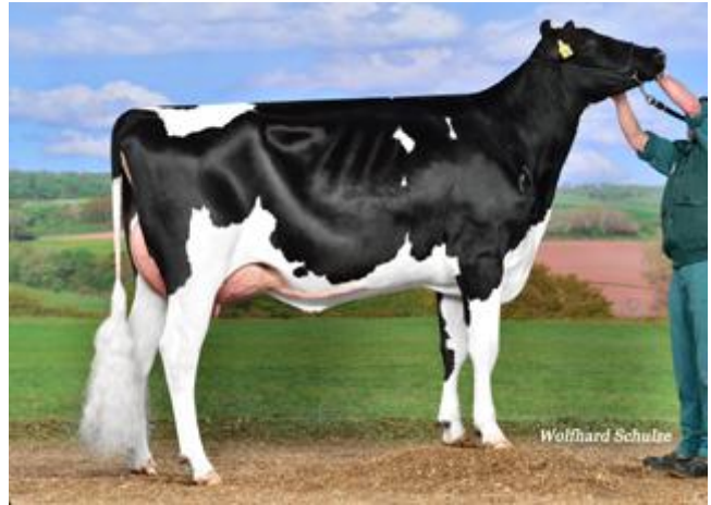
Suprem fullsister WKM Lady