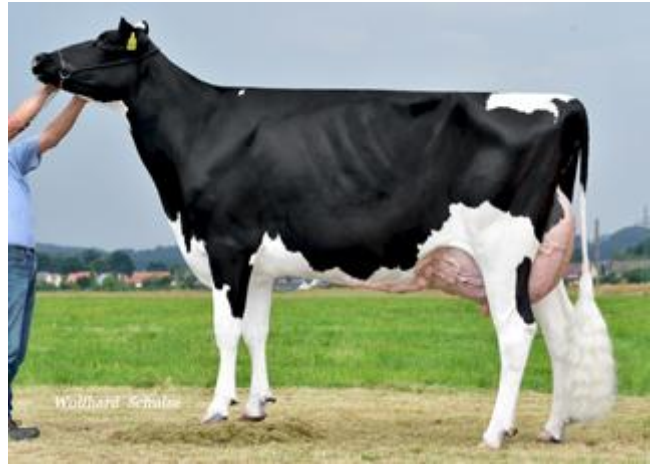
Royce granddam Mabelle, 3rd lact.