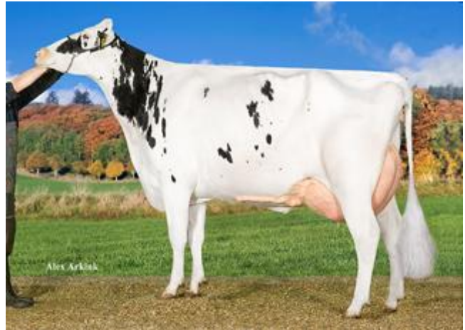
Monday grandddam Anderstrup Snowman Heaven