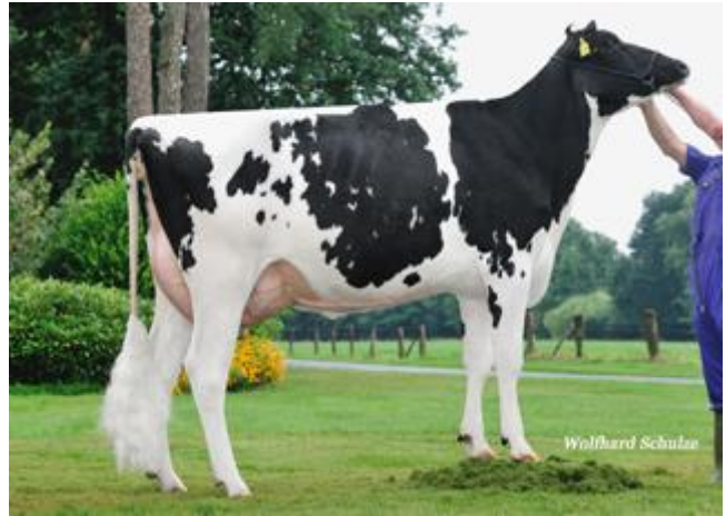
Monza dam WKM Emilia