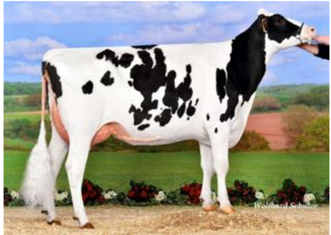
Buck daughter Lira