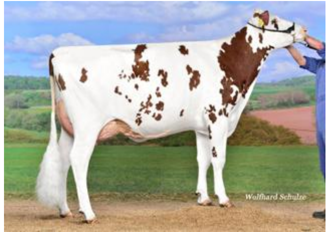
Air-Red daughter Limette