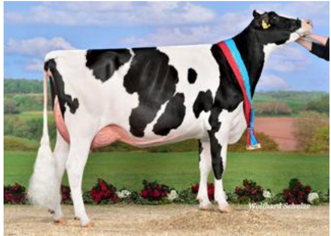
Garant daughter Hanuta